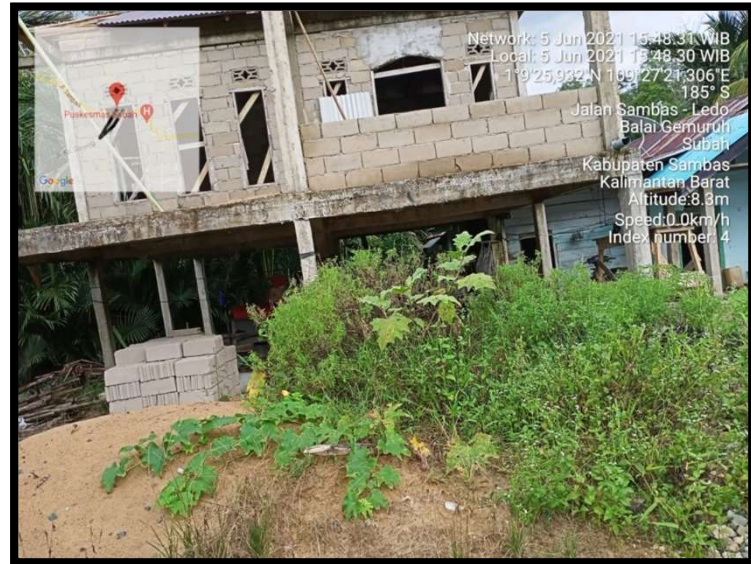
2. Village head's house